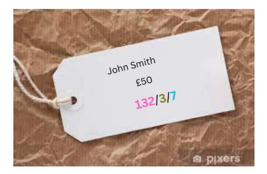
132 indicates your unique refence number